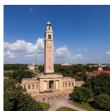
LSU, Baton Rouge