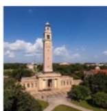
LSU, Baton Rouge