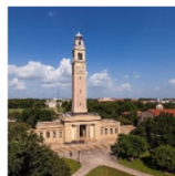
LSU, Baton Rouge