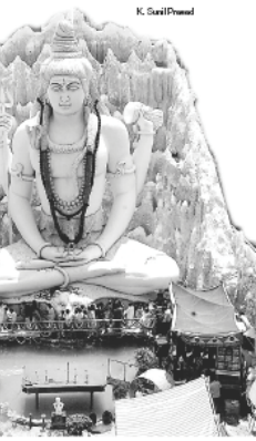
research on the subject has so far failed to find the source, a lake or even a river-bed. Night-long bhajans have been the attraction here for a long time.

The Kaadu Malleshwara temple at Malleshwaram dates to a century and is held in reverence by devotees who flock to the temple from afar. The mysticism of Mount Kailash, as described in skanda Purana and Shivrangana, is manifest here. A decade ago, a tank was excavated where water gushes out without any known source. Intensive